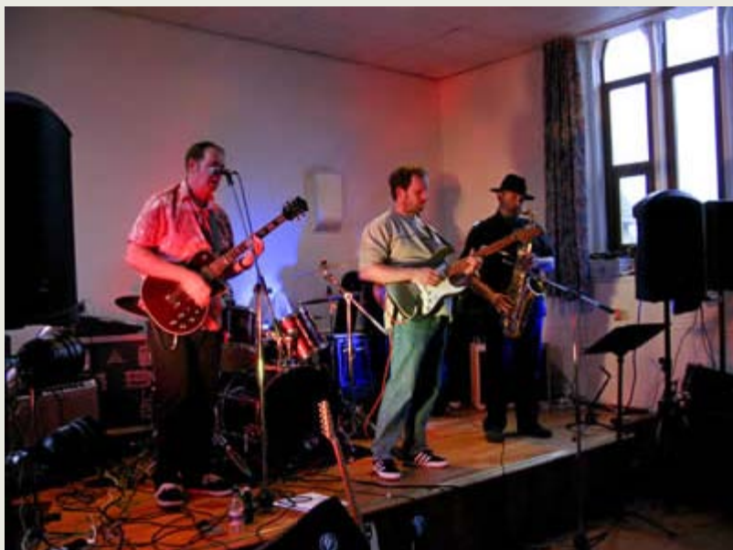
The Signifyers do their stuff...

We held our 2nd Summer Dance and BBQ at the Village Hall on Saturday 21 June 2008. The event was supposed to start at 8.00 pm but there were so many people there early that the first band - The Signifyers - started early, soon after 7.30 pm.