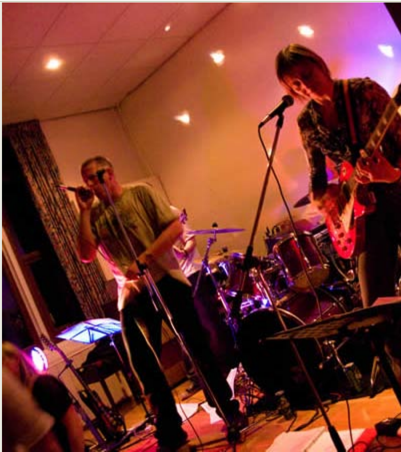
The Unusual Suspects got the place jumping - everything from T Rex to The Clash....