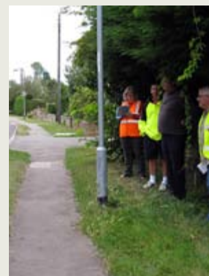
Both photos: Operation Speedwatch team on the High Street near Torpel Way